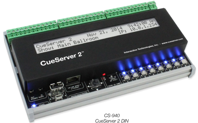
CS-940 CueServer 2 DIN

CueServer 2 DIN's front panel has eight customizable function buttons. Each button has a fully controllable RGB indicator. A navigation joystick is used to operate the onboard LCD menu for basic system settings, show selection, and macro execution.