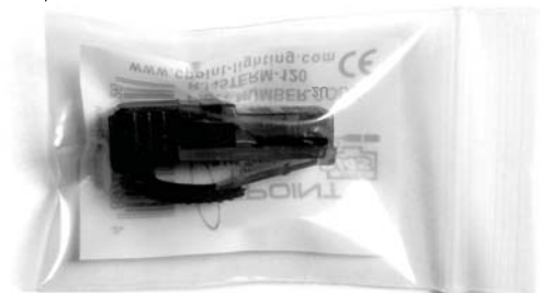
Height, max 13mm