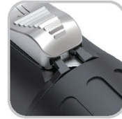
Anti-screw function design