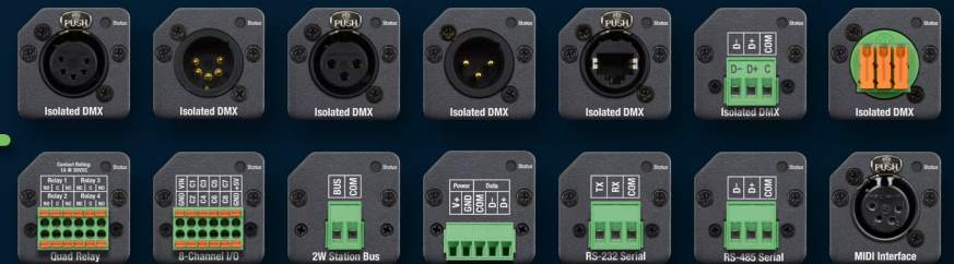
(Smart Modules sold separately)