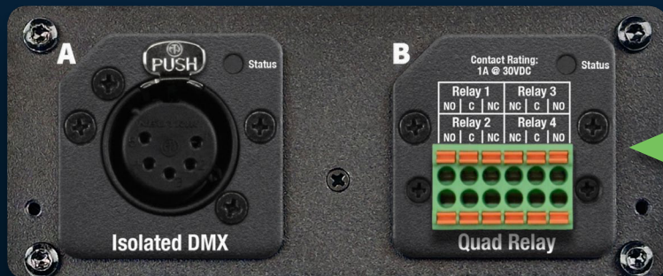
Back Panel of 2-Port SmartNode