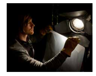
Set Light for Theatre