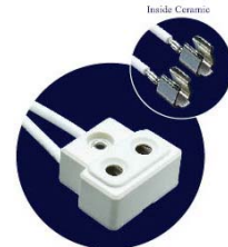
OSRAM TP22H socket