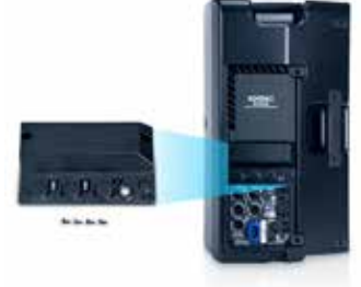
K.2 LOC (Lock-Out Cover)